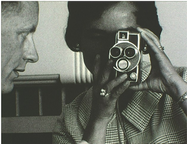
Still from Welcome San Francisco Movie Makers