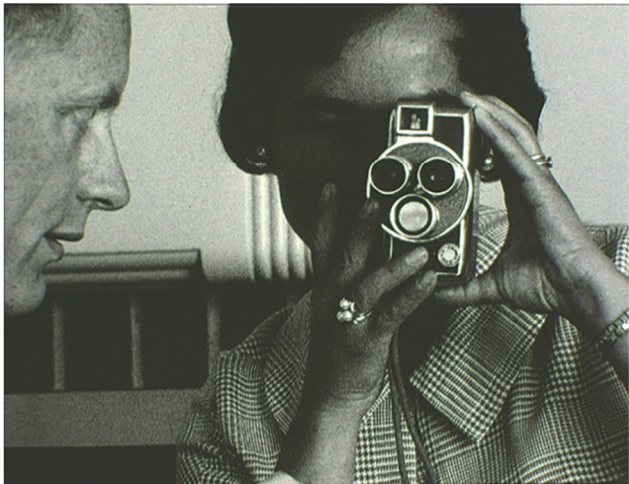
Still from Welcome San Francisco Movie Makers