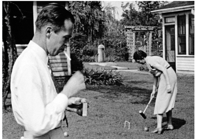
Still from Our Day , Courtesy of the Center for Home Movies