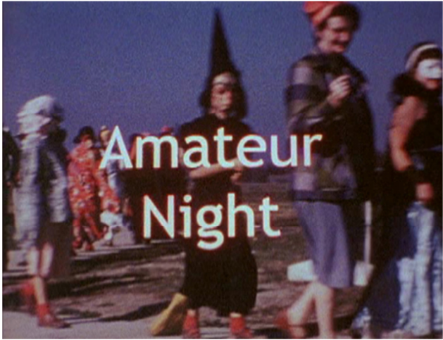
Amateur Night title sequence, designed by Kerry Laitala

High resolution versions available on www.amateurnightmovie.com